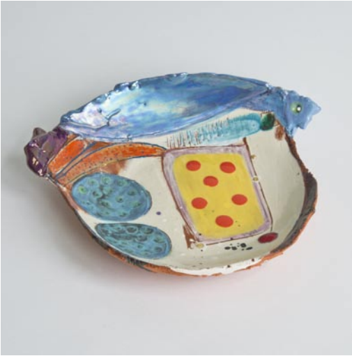
Cornish ware platter with blue mother of pearl back wall, yellow oblong with 6 red dots 5.5 H x 22cms D x 24.5cms W