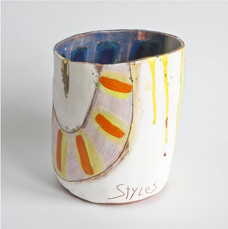
Vessel with 7 blue squares on pink/blue lustre ground 21cms H x26,5cms W