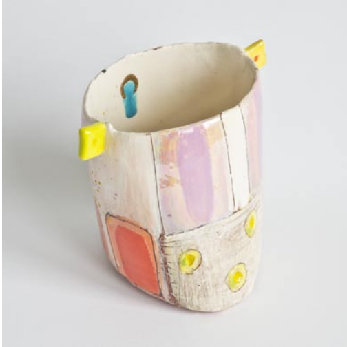
Cornish ware beaker with 2 orange oblongs and green/yellow lugs 14cms H x 16cms W