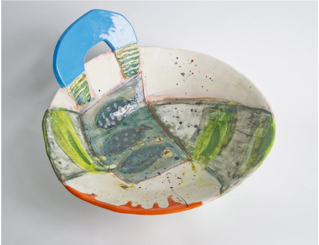
Turquoise handled shallow dish with 3 lustre fishes and orange drip rim 22cms H x 41cms W