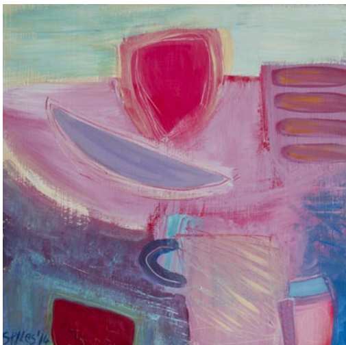
Love and kindness Mixed media on board 27cms x 27cms 2014