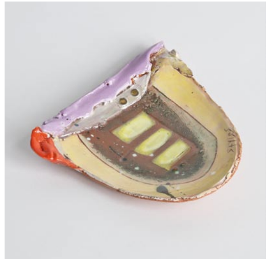
Cornish ware platter with lilac back and three yellow oblongs 3cms H x 16cms D x 17cms W