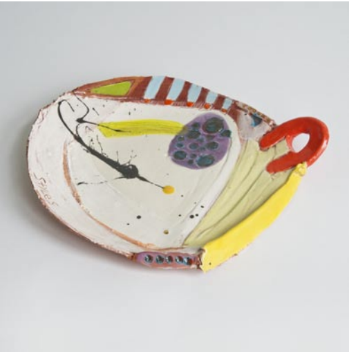
Cornish ware platter with orange red loop handle, black splash and yellow dot 4.5cms H x 28cms D x 23cms W