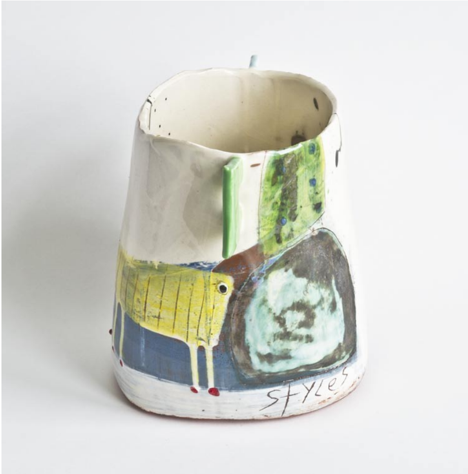
Beasty pot green/pale blue handles 20cms H x 23.5cms W