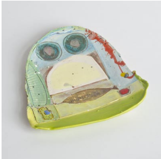
Cornish ware platter with gold fish and white under yellow shape 3cms H x 20cms D x 18cms W