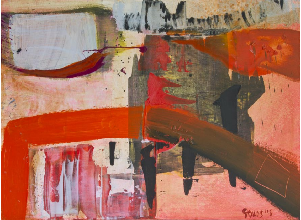
Shepherds warning Acrylic on marine ply 45cms H x 63cms W 2015