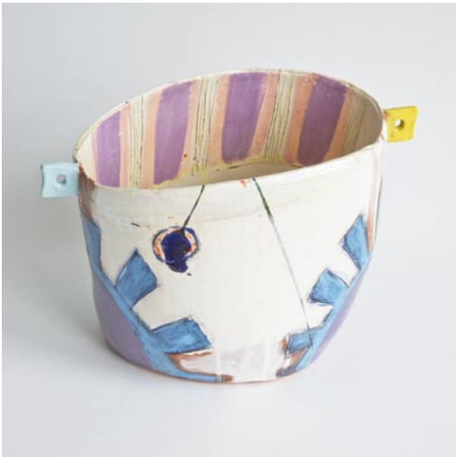
Cornish ware pot with 2 big flower shapes, pale blue/yellow lugs 21cms H x 29cms W