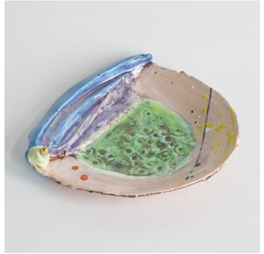
Cornish ware platter with copper green shape and yellow lug 4cms H x 19cms D x 18cms W