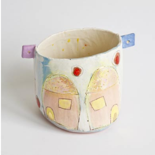
Cornish ware pot with 2 gold shapes, 1 green lug and 3 orange discs 17cms H x 20cms W