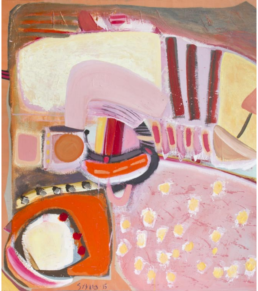
When the sun shines hot acrylic on calico covered marine ply 87cms H x 55cms W 2015