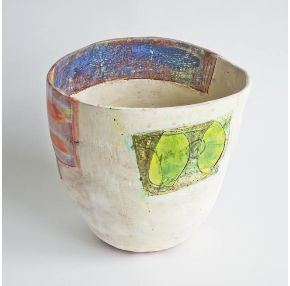
Flower pot slipped and multi surfaced terracotta 28.5cms H x 28cms W