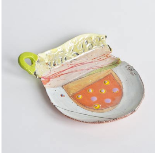
Cornish ware platter with green loop handle and orange under lilac dots 4cms H x 20cms D x 16cms W